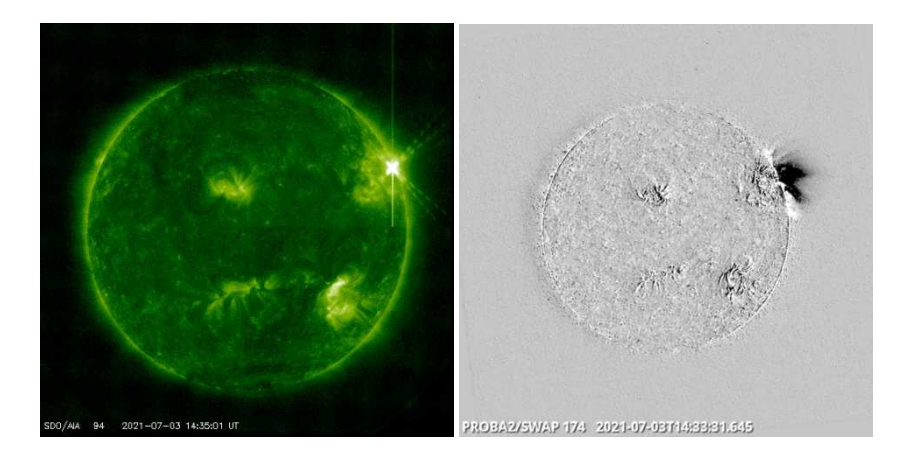
Figure 1 ~ Solar flare images for 3 July. <u>Left</u>: SDO/AIA 094 {<u>SDO</u>} image shows the flare near the northwest limb at 1435 UTC shortly after its peak in extreme ultraviolet (EUV) wavelength of 9.4 nm, corresponding to a temperature of 6 million kelvin.

Solar Active Region 2838 produced an X1.5 x-ray flare between 1418 and 1429 on 3 July 2021 (figure 1). The Space Weather Prediction Center (SWPC) Events report showed numerous radio emissions associated with the flare including bursts in the UHF and SHF ranges and sweeps in the HF and VHF ranges {<u>SWPCEvnt</u>}. The flare was reported by SpaceWeather.com as the strongest since September 2017 (<u>SpWx</u>). It also was the strongest so far in solar cycle 25.